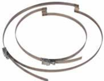
Hose Clamps 6" - 9"