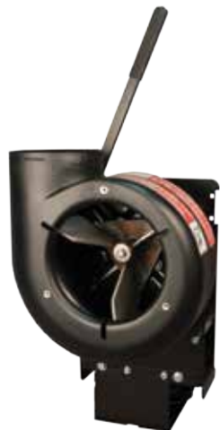
3-Blade Steel Impeller & Cross Linked Polyethylene Blower Housing on PTO-R

The PRO2B+ is the perfect solution for smaller ZTR mowers. The Pro 2B+ features our PTO-R drive that easily deals with the heavy grass and wet leaves that can plug a weaker collection system. It's powerful, lightweight, and affordable; making it perfect for the homeowner.