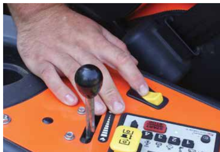
Engage PTO-X Drive From Operator's Seat