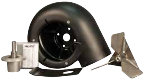
Upgrade Kit: Converts 2-Blade System to 3-Blade A1843