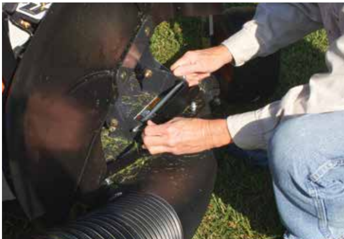
Easy No Tool Removal (Once Installed)