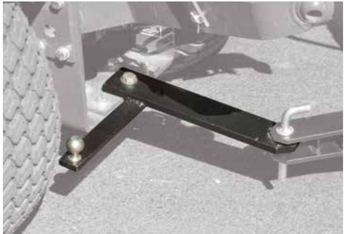
Optional Extra Length Tongue Extender