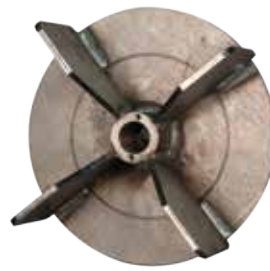
4-Blade Impeller A0645