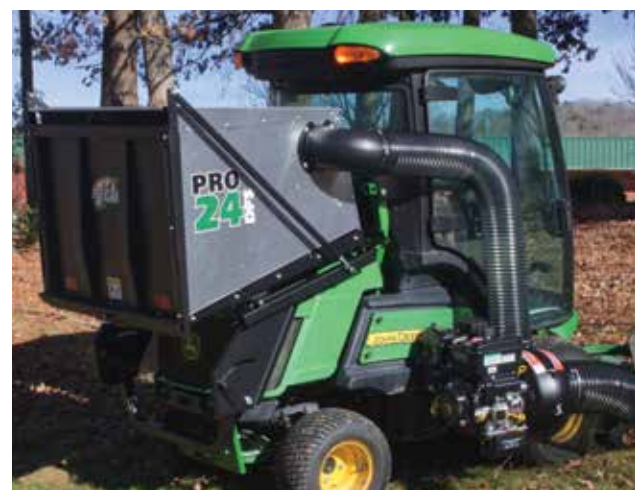
Now Available for Cab Models