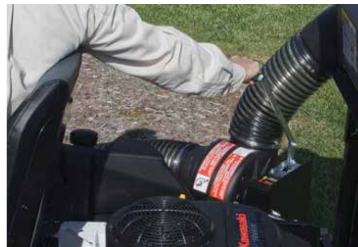
Engage Drive From Operator's Seat