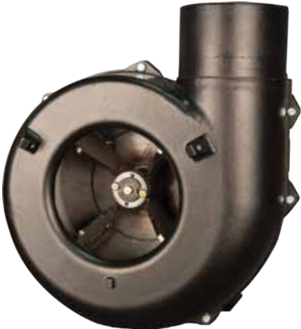
4-Blade Steel Impeller and Cast Aluminum Blower Housing

The PRO12 DFS (Dump From Seat) is a mounted aluminum box designed for one-handed dumping from the operator's seat. The Pro 12 DFS will increase your productivity, whatever your application. Featuring our patented mid-mounted blower, it has the power to handle today's high output commercial decks.