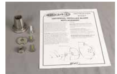
Tapered Bushing Kits