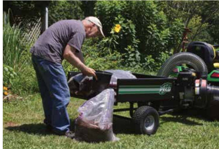
Converts to a Dump Cart in Minutes