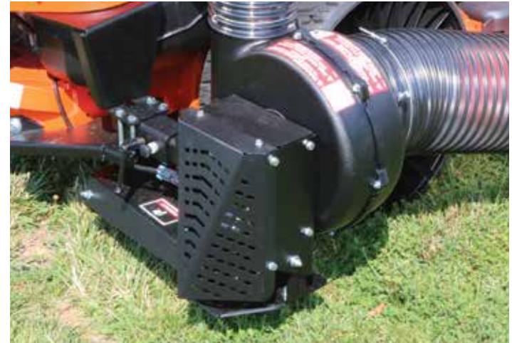
PTO-X with Self-Tensioning Belt and Electric Clutch Engagement