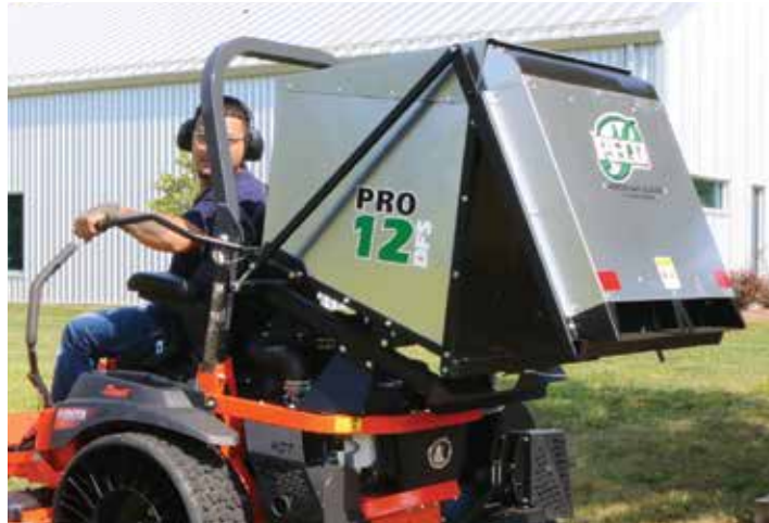
Easy Dump From Seat