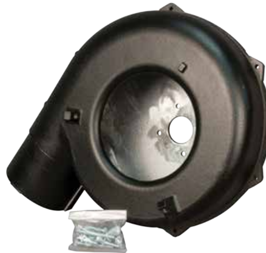
Blower Housing Small E4052A Large E5007A