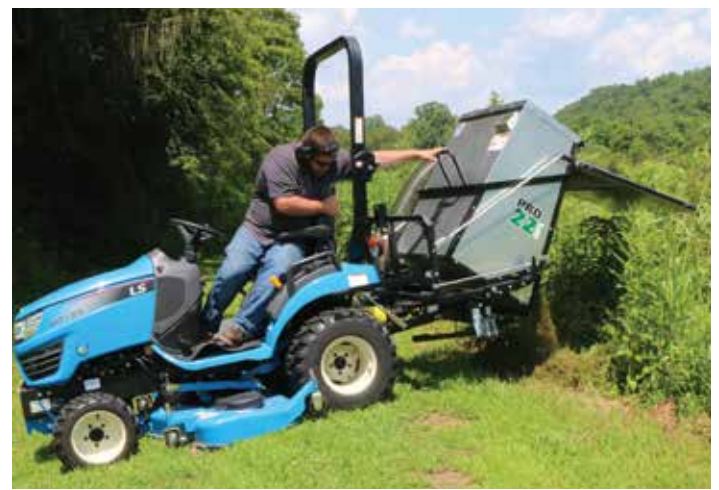
Huge 22 Cubic Foot Capacity Box Dumps From Seat