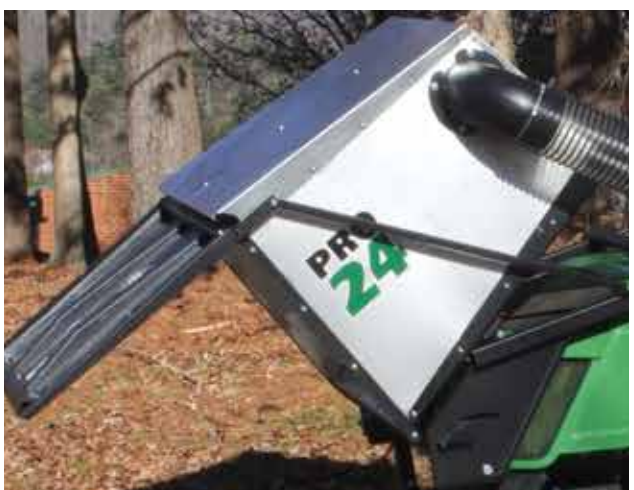
Huge 24 Cubic Foot Box Dumps From Seat (On Non-Cab Models)

Turn to the PRO24 DFS to match the function and utility of your out-front mower. The huge 24-cubic foot vacuum system is fully mounted, adding less than a foot to the mower's total tail swing. Its exclusive pivot frame assembly allows the entire collection box to pivot to the rear, allowing full service access on the tractor.