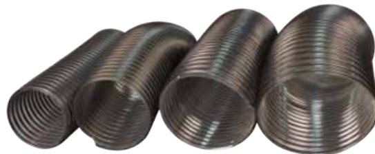
6" F0060 7" F0070 8" F0080 9" F0090