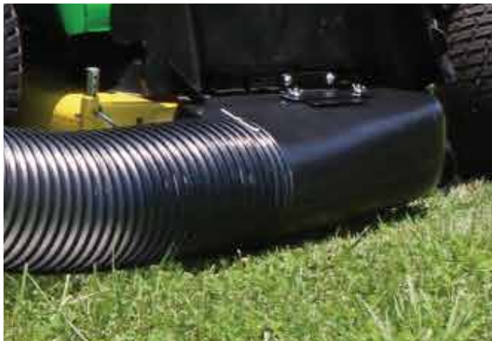
Heavy-Duty Polyethylene Universal Boot