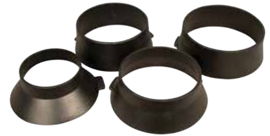
Blower Cones 6" - 9"