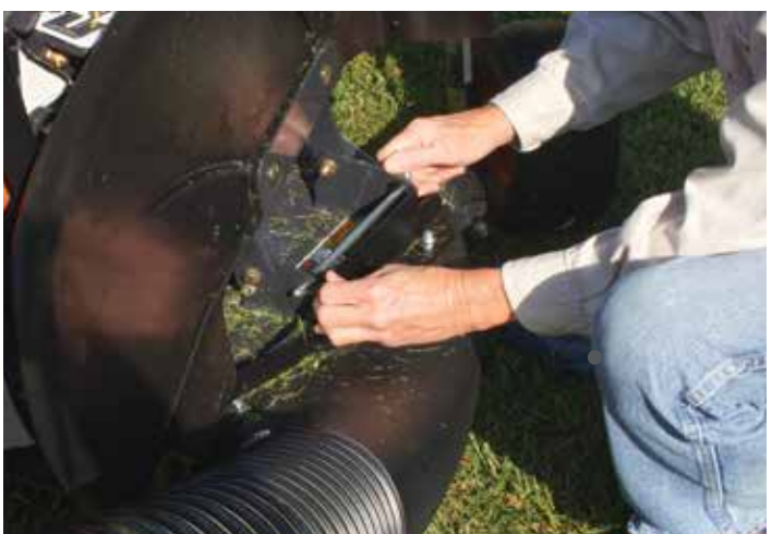
Easy No Tool Removal (Once Installed)