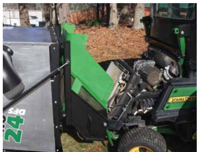
Access Engine Compartment to Mower