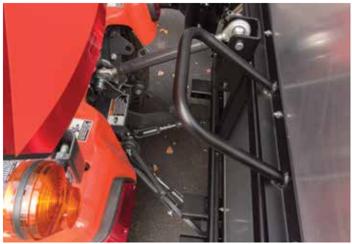
Fits Most Category 1 Three-Point Hitch