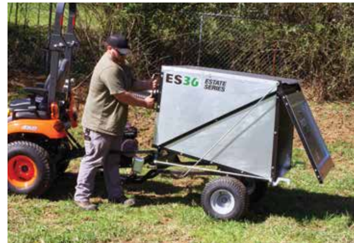
Easy Dump Action