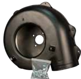
Small Blower Housing PTO Systems E4004A