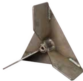
3-Blade Impeller A1839