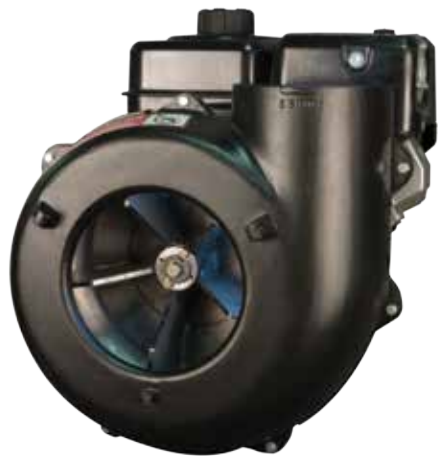
5-Blade Impeller and Large Aluminum Blower Housing on ES50 (4-Blade on ES36)

The 36 & 50 ESTATE SERIES professional grade Trailer Vacs have the capacity to handle compact tractors with mower decks up to 72". Both models are equipped with the Trail-o-Matic hitch, which eliminates stretching or dragging the hose. The tapered aluminum box provides easy dumping with a quick lever pull.