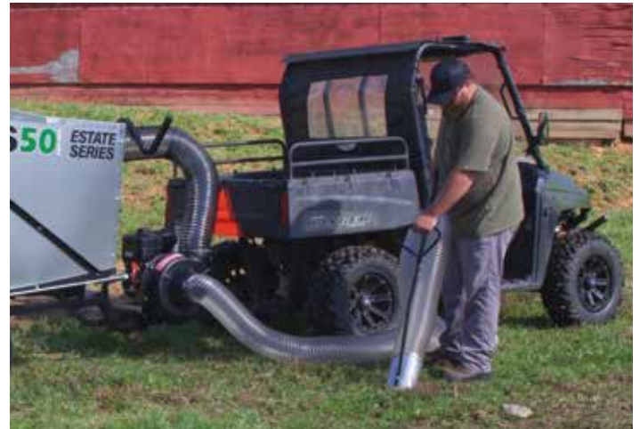
18' Wand Kit Included