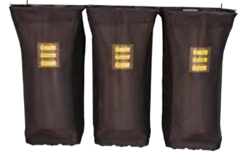
Fabric Collection Bags with Hard Plastic Bottom